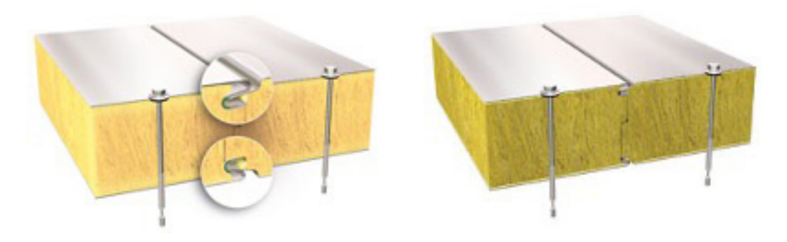
Figure 1. An example of an SPA panel with a mineral wool insulation core.

Ruukki has the right to use CE marking for sandwich panels (EN 14509). By affixing CE marking to a product, the manufacturer indicates that the product conforms to all relevant legislative requirements, in particular to health, safety and environmental protection requirements.